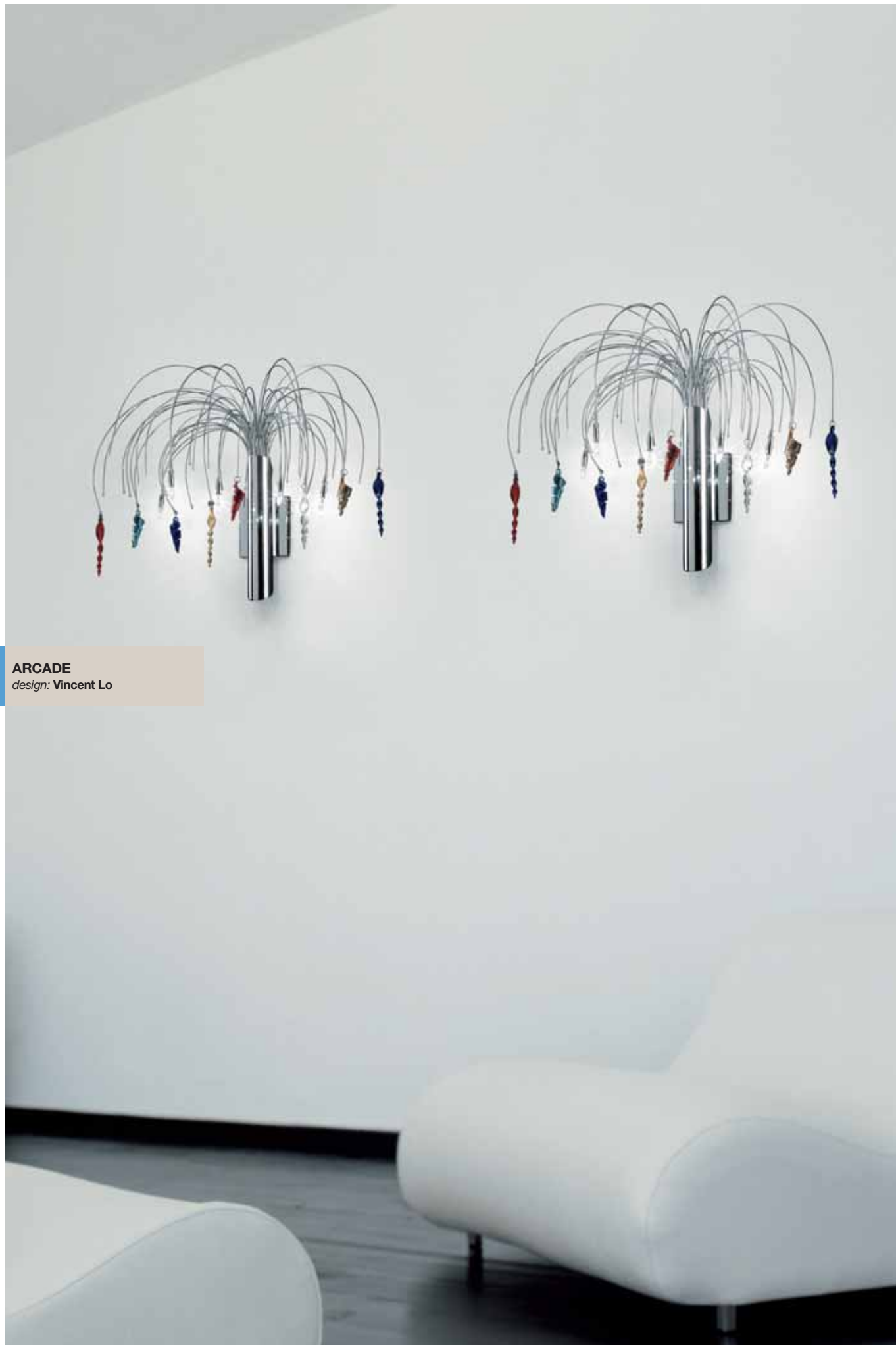
ARCADE design: Vincent Lo