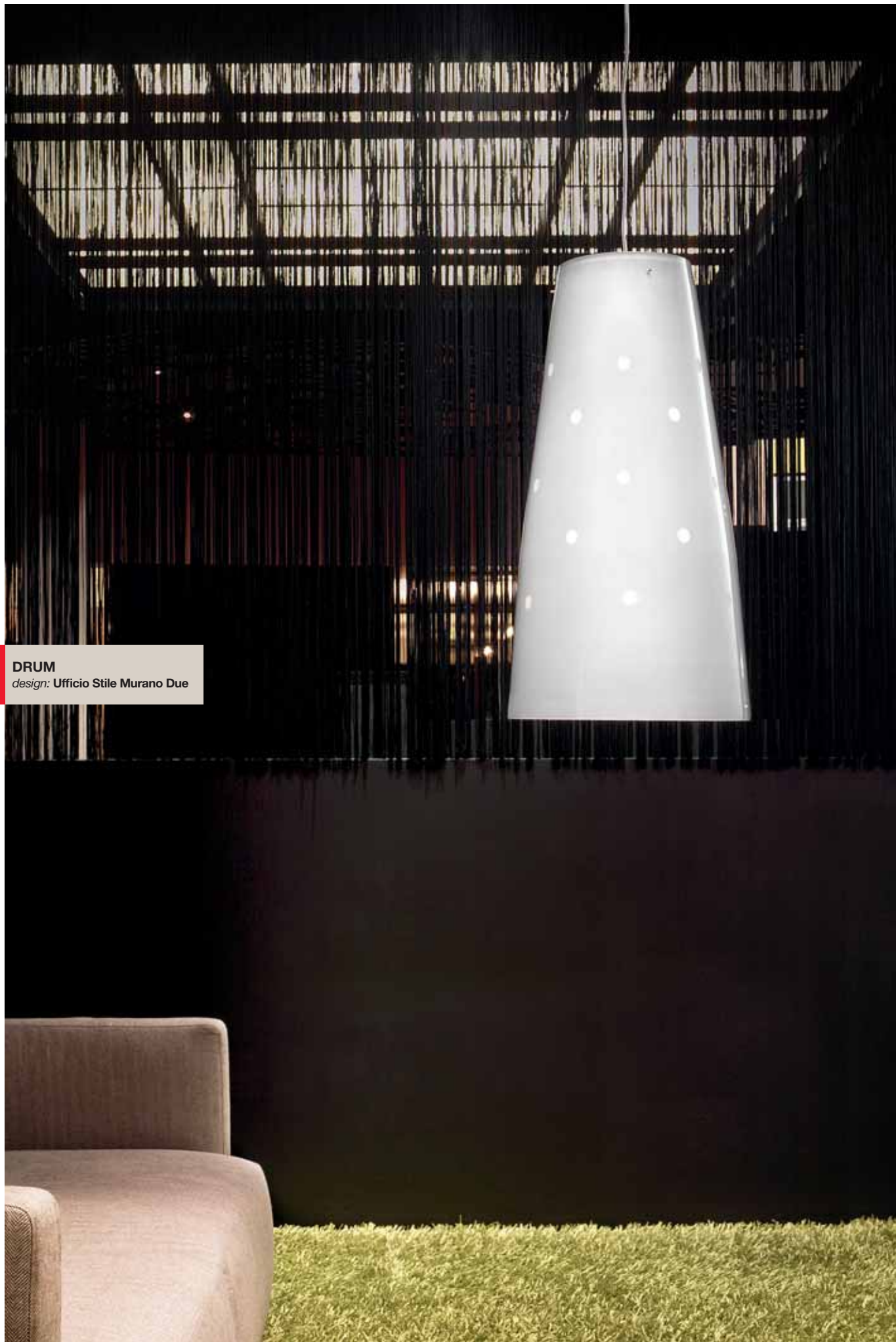
DRUM design: Ufficio Stile Murano Due