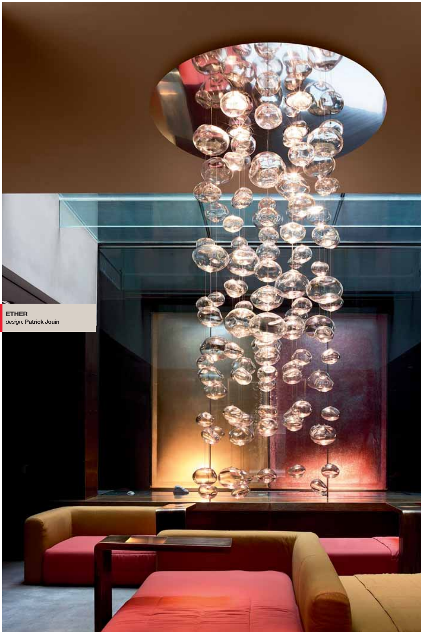
ETHER design: Patrick Jouin